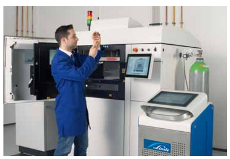
Reviewing the printed part.

Linde has developed a highly effective solution to improve cleaning. ADDvance® Cryoclean technology creates dry ice particles, or "snow", by expanding liquid \mathrm{CO}_2 and using compressed air to accelerate the particles up to sonic speed, shooting them onto the surface to be cleaned. The cleaning effect relies on flash cooling, kinetic energy, embrittlement and gas impact. If needed, a further abrasive agent can be added to the dry ice particles to remove more stubborn powder residue.