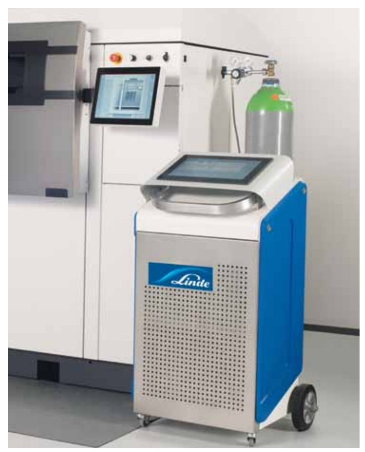
The ADDvance® O<sub>2</sub> precision ensures the atmosphere inside the print chamber.

Across all these AM approaches, atmospheric gases play a fundamental role in both the core printing process in addition to pre- and post-production processes such as metal powder production and storage. As is well understood and established earlier in this article, the core AM process takes place within a closed chamber filled with high-purity