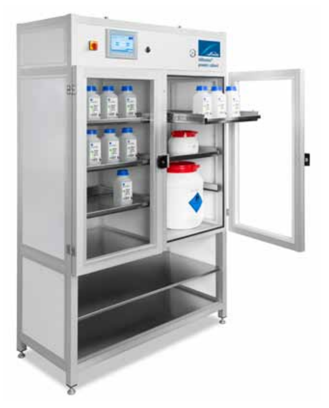
The ADDvance® powder cabinet provides the optimal storage environment for metal powders.

It is essential to maintain the correct atmosphere during storage in order to avoid humidity. Humidity will lower the flowability of the powder and will increase the amount of O_2 during printing. The latest addition to Linde's AM solutions now includes Linde's ADDvance® powder cabinet to ensure optimal conditions for powder storage.